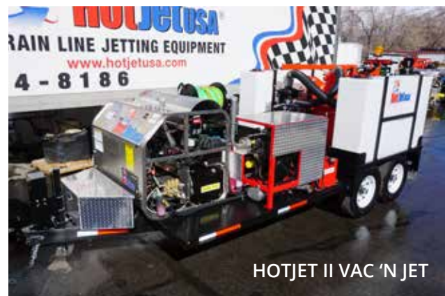
HOTJET II VAC 'N JET