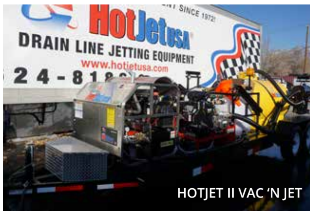
HOTJET II VAC 'N JET