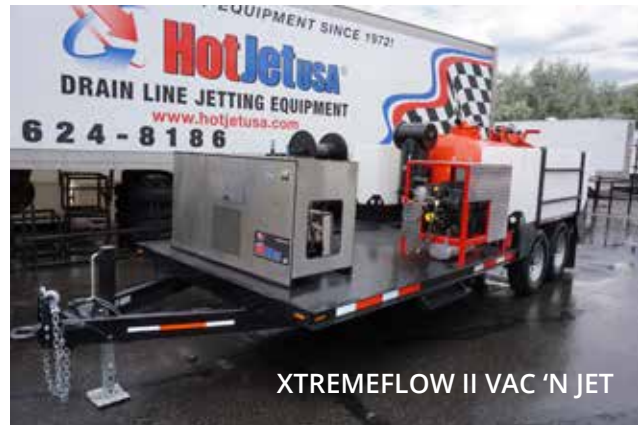
XTREMEFLOW II VAC 'N JET