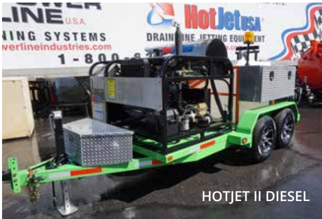
HOTJET II DIESEL