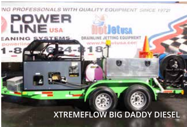
XTREMEFLOW BIG DADDY DIESEL