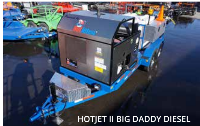
HOTJET II BIG DADDY DIESEL